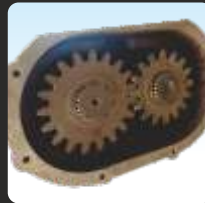
2 speed gear box