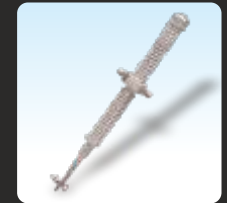
Powerful spring rod assembly