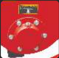
Oil immersed side bearing