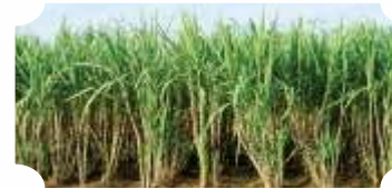
Sugar Cane Fields