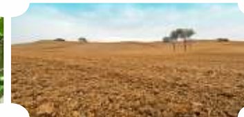
Black & Hard Soil