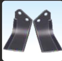
International quality steel blades with less wear & tear