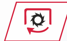
HIGHEST PTO POWER WITH 4 SPEEDS