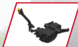
ADDC HYDRAULIC LIFT