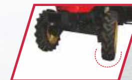
OPTIMIZED TURNING RADIUS