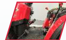
HIGHLY SPACIOUS PLATFORM