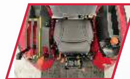
SIDE SHIFT GEAR LEVERS