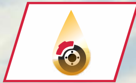
MULTI DISC OUTBOARD OIB