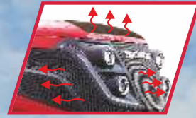
6 STAGE COOLING