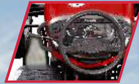
12+12 SOLIS SHUTTLE SHIFT