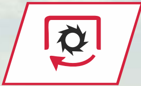
HIGHEST PTO POWER