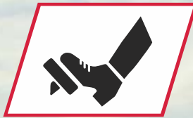
DUAL CLUTCH / *DOUBLE CLUTCH