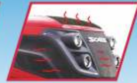
6 STAGE COOLING