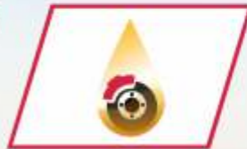
MULTI DISC OUTBOARD OIB