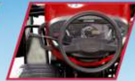
12+12 SOLIS SHUTTLE SHIFT