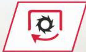
HIGHEST PTO POWER