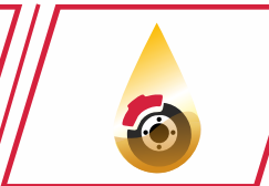
MULTI DISC OUTBOARD OIL