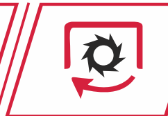
HIGHEST PTO POWER