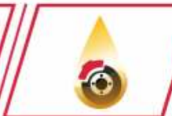
MULTI DISC OUTBOARD OIB