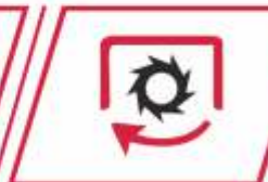
HIGHEST PTO POWER