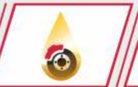
MULTI DISC OUTBOARD OIB