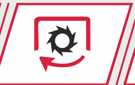
HIGHEST PTO POWER