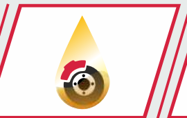
MULTI DISC OUTBOARD OIB