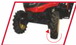
OPTIMIZED TURNING RADIUS