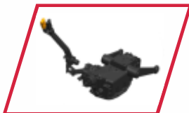
ADDC HYDRAULIC LIFT