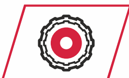
12.4*24 BIG REAR TYRE SIZE