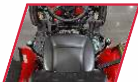
SIDE SHIFT GEARS