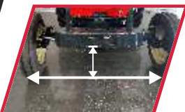
HIGH GROUND CLERANCE