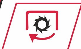
HIGHEST PTO POWER WITH 4 SPEEDS