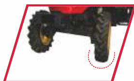
OPTIMIZED TURNING RADIUS