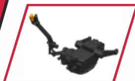
ADDC HYDRAULIC LIFT