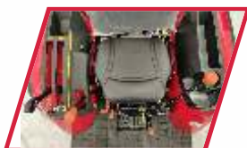
SIDE SHIFT GEAR LEVERS