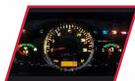
DIGITAL INSTRUMENT CLUSTER