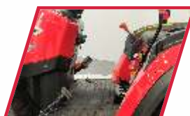
HIGHLY SPACIOUS PLATFORM