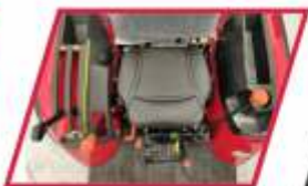
SIDE SHIFT GEAR LEVERS