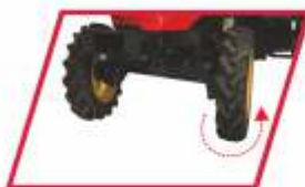
OPTIMIZED TURNING RADIUS