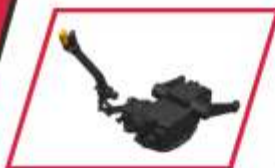
ADDC HYDRAULIC LIFT