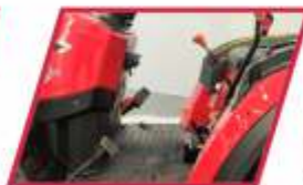
HIGHLY SPACIOUS PLATFORM