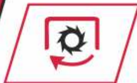
HIGHEST PTO POWER WITH 4 SPEEDS