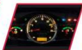
DIGITAL INSTRUMENT CLUSTER