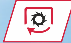
HIGHEST PTO POWER WITH 4 SPEEDS