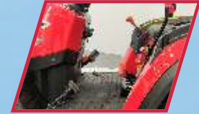
HIGHLY SPACIOUS PLATFORM