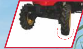
OPTIMIZED TURNING RADIUS