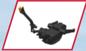
ADDC HYDRAULIC LIFT