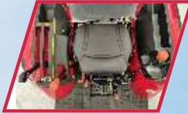
SIDE SHIFT GEAR LEVERS