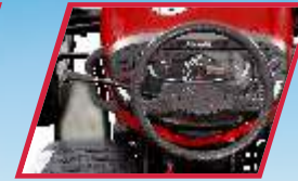
12+12 SOLIS SHUTTLE SHIFT