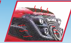
6 STAGE COOLING